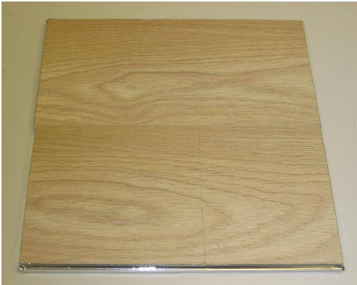
A003: Kingfisher TS Cardiff Oak

Hinweis: Die Untersuchungsergebnisse beziehen sich ausschließlich auf den vorgelegten Prüfgegenstand. Der Bericht verliert umgehend seine Gültigkeit bei Änderungen der Zusammensetzung oder des Produktionsverfahrens des Prüfgegenstandes. Eine vollständige oder auszugsweise Veröffentlichung des Prüfberichtes bedarf der Genehmigung.