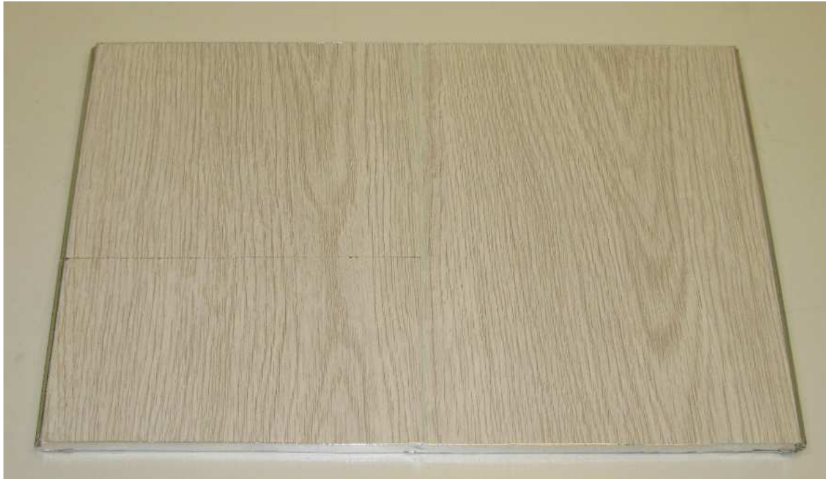
A001: B&Q Overture Arlington effect